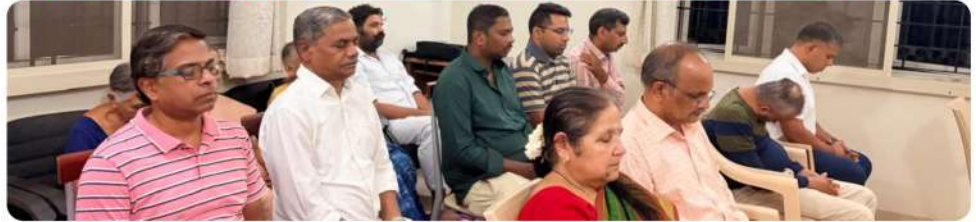
Meditators gathered at Antar-Manasa on 2nd April 2026, Full Moon Day to practise Kamadahana.